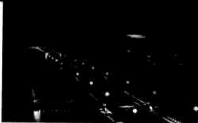
San Francisco-Oakland Bay Bridge at night