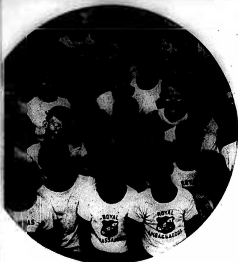
Are your boys growing up with high purposes in enthusiastic Royal Ambassador Chapters?

for a cause was illustrated repeatedly during World War II, in the Japanese "suicide" pilots, in the German army youth who fanatically risked their lives for their Fuehrer, in our own young people who gave their lives for the cause of freedom.