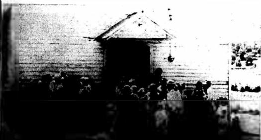
Below: Sunday school is about to begin at Bruno, Arkansas