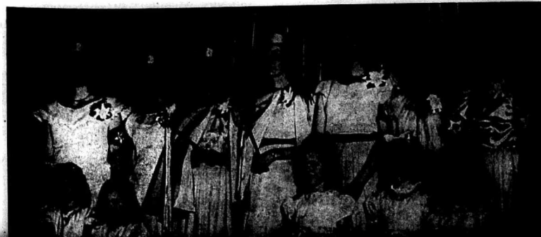
Girls love the solemn moments in beautiful coronation services in Girls' Auxiliary. Sunbeams help and look forward to belonging to this growing company of girls.

Another responsibility which we have is to see that young people are informed. Through our missionary organizations, Sunday school and Training Union, we can present the needs of the world and give the latest information on what is going on in the world, as well as what other young people are thinking and doing. We have excellent channels of presenting our world program and challenging our young people to have a part in it through our Baptist literature and visual aids. For instance, many young Baptists do not know about the youth work of the Baptist World Alliance, nor the forthcoming Baptist World Youth Congress to be held at Rio de Janeiro in 1953 and the finest young people in our churches should be encouraged to attend. We have a responsibility also to inform them of other Christian youth groups for our youth will be encouraged by the knowledge that young people of other denominations are working to bring