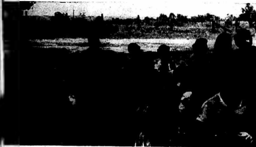
Above: Whiteville Baptists enjoy school picnic

I mentioned the wonderful experiences of working with people but I would not forget the blessings wrought by private prayer. Never before has my vision been so widened or so enriched. How true is the statement that if we ask in faith believing, the Lord supplies beyond our greatest expectations. I know because I prayed and he heard.