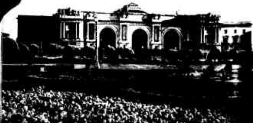
Below: San Francisco Municipal Auditorium

C HANGING the famous words, "Go West, young man, go West," we say "Come West, Southern Baptists, come West." Since the work of Southern Baptists is very young in California, this is our first opportunity to be hostess to the Woman's Missionary Union annual meeting. We the members of W.M.U. of California extend to you a most hearty welcome to the Golden State.