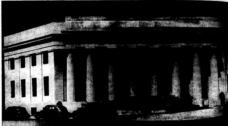
This building changes from selling life insurance to proclaiming life eternal